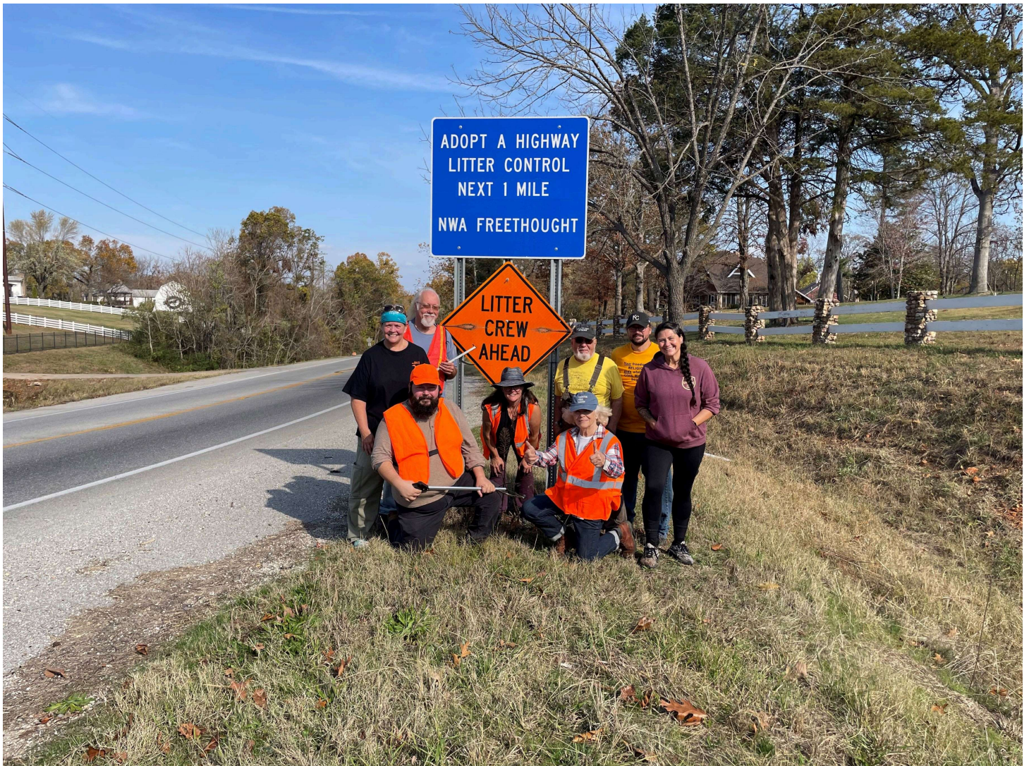
The Ozarks Chapter of FFRF out working on a beautiful fall morning on November 17th to pick up trash along AR-12.

Christian Nationalism, and how the influential-but-little-known group FFRF.org plays an outsized role in protecting separation between church & state. After the presentation, the combined UU and FFRF members met at GotAHold Brewery to relax and socialize on a balmy November afternoon. In December, several of our members visited the Capitol Building in Little Rock, AR, where, in combination with the Arkansas Society of Freethinkers , we erected a secular "Bill of Rights Nativity" display. We closed out the year by welcoming the Winter Solstice with TrailMix NWA while also hosting a small Festivus Celebration.