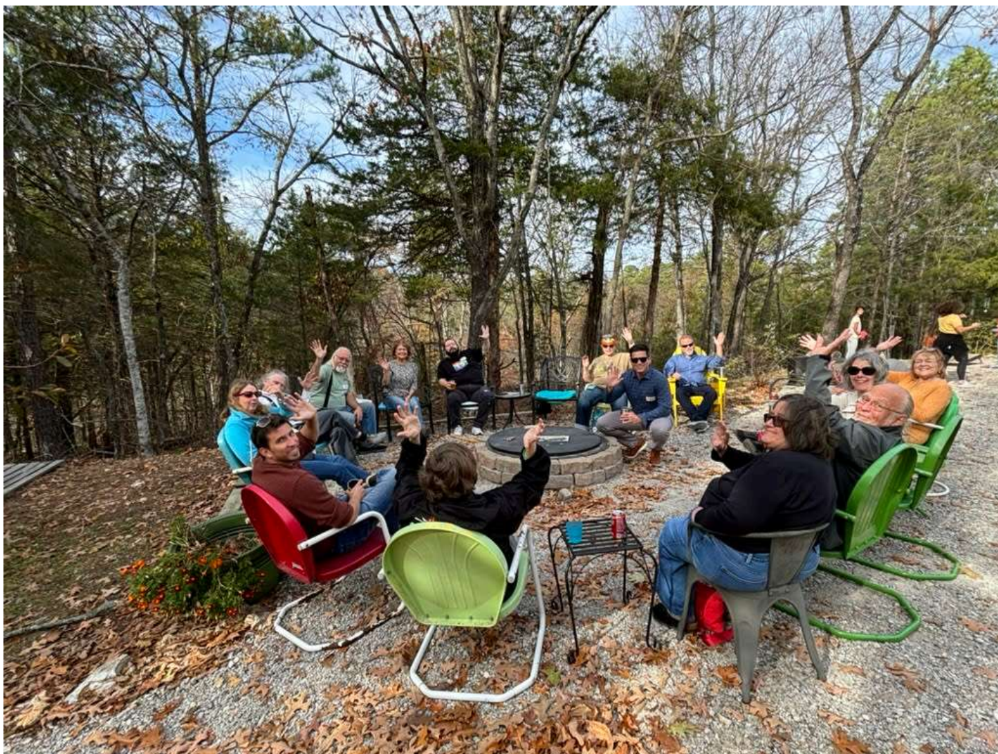
FFRF and UU members gather to socialize at GotAHold Brewing in Eureka Springs, AR, on a warm fall afternoon on November 24th.