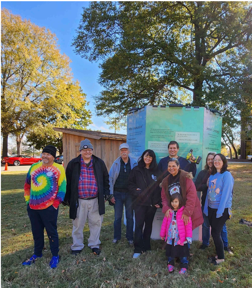
Arkansas Society of Freethinkers in collaboration with Ozarks Chapter of FFRF.