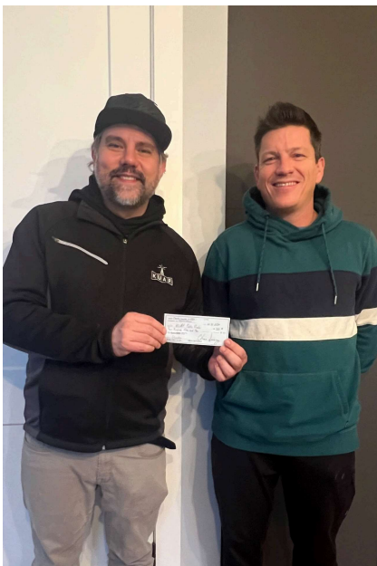
General Manager of KUAF Public Radio accepting a donation from Ozarks Chapter of FFRF.