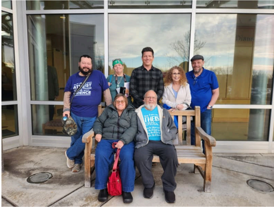
Ozarks Chapter of FFRF in front of the OU Schusterman - Perkins Auditorium in Tulsa, OK, on March 7, 2026.

As a reminder, there are numerous ways to connect with secular folks here in Northwest Arkansas! We've touched on the different groups in this area, including Recovering From Religion (RFR) , NWA Freethought and Atheist Community of NWA . These groups plan separate activities that may be of interest to people, and we encourage our members to research & explore these likeminded organizations. For example, NWA Freethought has a monthly " Final Friday " meetup, which takes place on Friday, March 27th (tomorrow) at South Yard in Fayetteville. On Saturday, March 28th, Indivisible NWA is hosting a NO KINGS rally from 9:30am to 1:00pm at 6 W Dickson St (the intersection of Dickson Street and East Ave.) in Fayetteville. Finally, this Sunday, March 29th, the Ozarks Chapter of FFRF in collaboration with NWA Freethought will be cleaning a 1 mile stretch of AR Highway 12. We would love to see the secular community come out to help keep Arkansas beautiful!